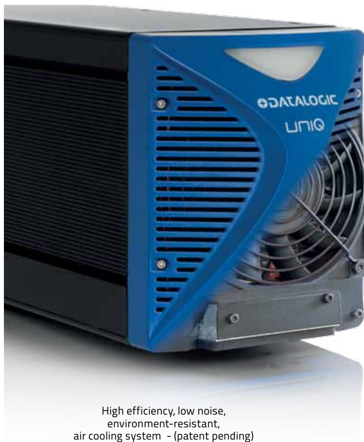
High efficiency, low noise, environment-resistant, air cooling system - (patent pending)

Laser interaction with organic or inorganic material can cause TOXIC FUMES/PARTICLES. The OEM laser components described in this product guide is for sale solely to qualified manufacturers, who shall provide interlocks, indicators and other appropriate safety features in full compliance with applicable national and local regulations.