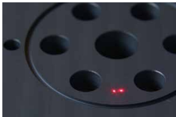
Twin beams for easy focus finding