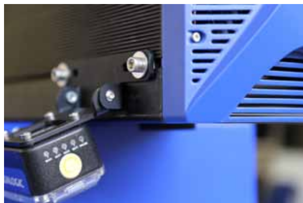
EasyFix mounting rail for accessories